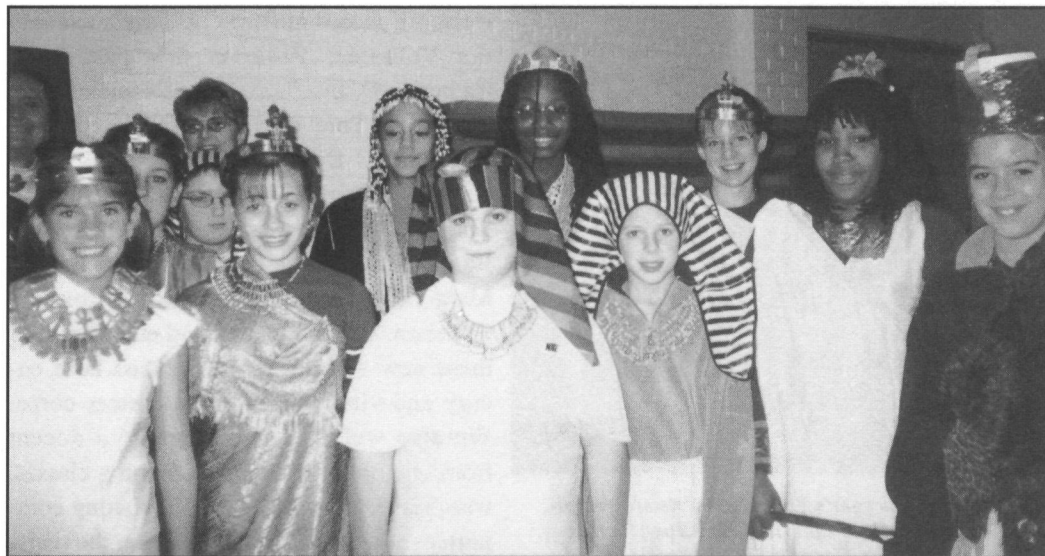
During outreach visit, 6th graders from James Hart Middle School enjoy dressing up as queens and pharaohs for a day.

The Outreach Program continued to retain a loyal cadre of client support, as well as attract new audiences to enjoy this special "in-school field trip" experience. The Outreach Program continued to receive accolades and praise from students, educators, parents, and adults throughout met-